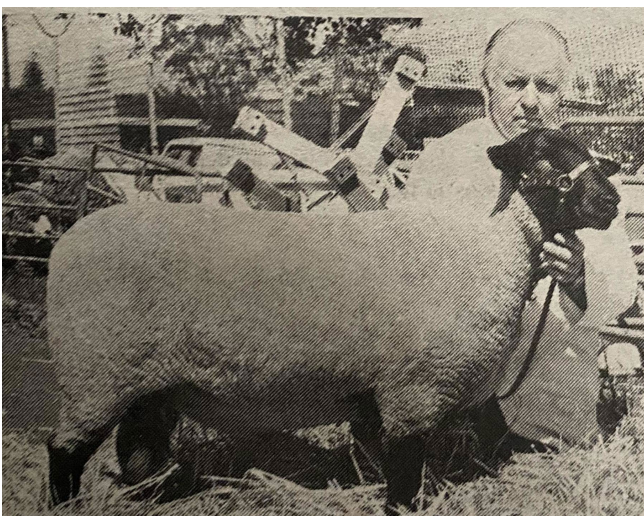
SPECIAL SUFFOLK: The Perth Show champion Suffolk ram shown by DW&PM Barkley, Newbold, Gawler River.