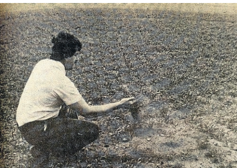
NO RAIN: Crops were failing due to drought.

In September 1977, it was all go for many shows, including Adelaide, Melbourne, Perth, Gawler and Wudinna; the drought was one of the "worst this century"; and ram sales and field days were also on. More photos at stockjournal.com.au